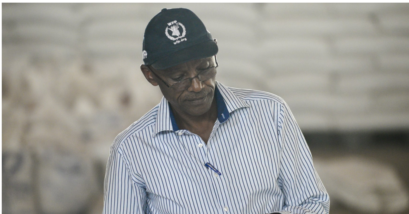
WFP worker supervising the loading of relief food at a warehouse in Jijiga, capital of Ethiopia's Somali Region, May 2016.